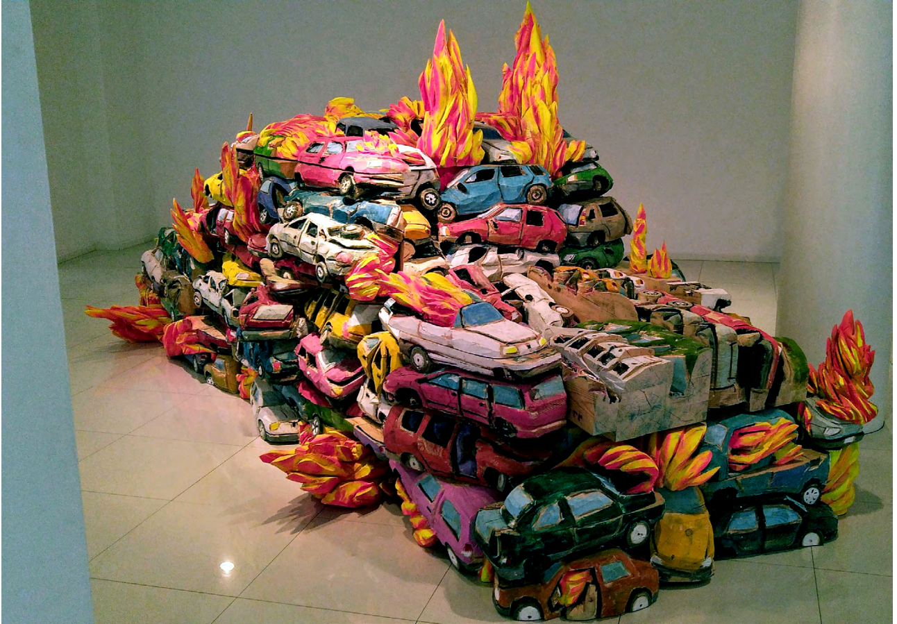
3Punts Kiko Miyares Autorun Polychrome Wood 200 x 500 x 230 cm 2020