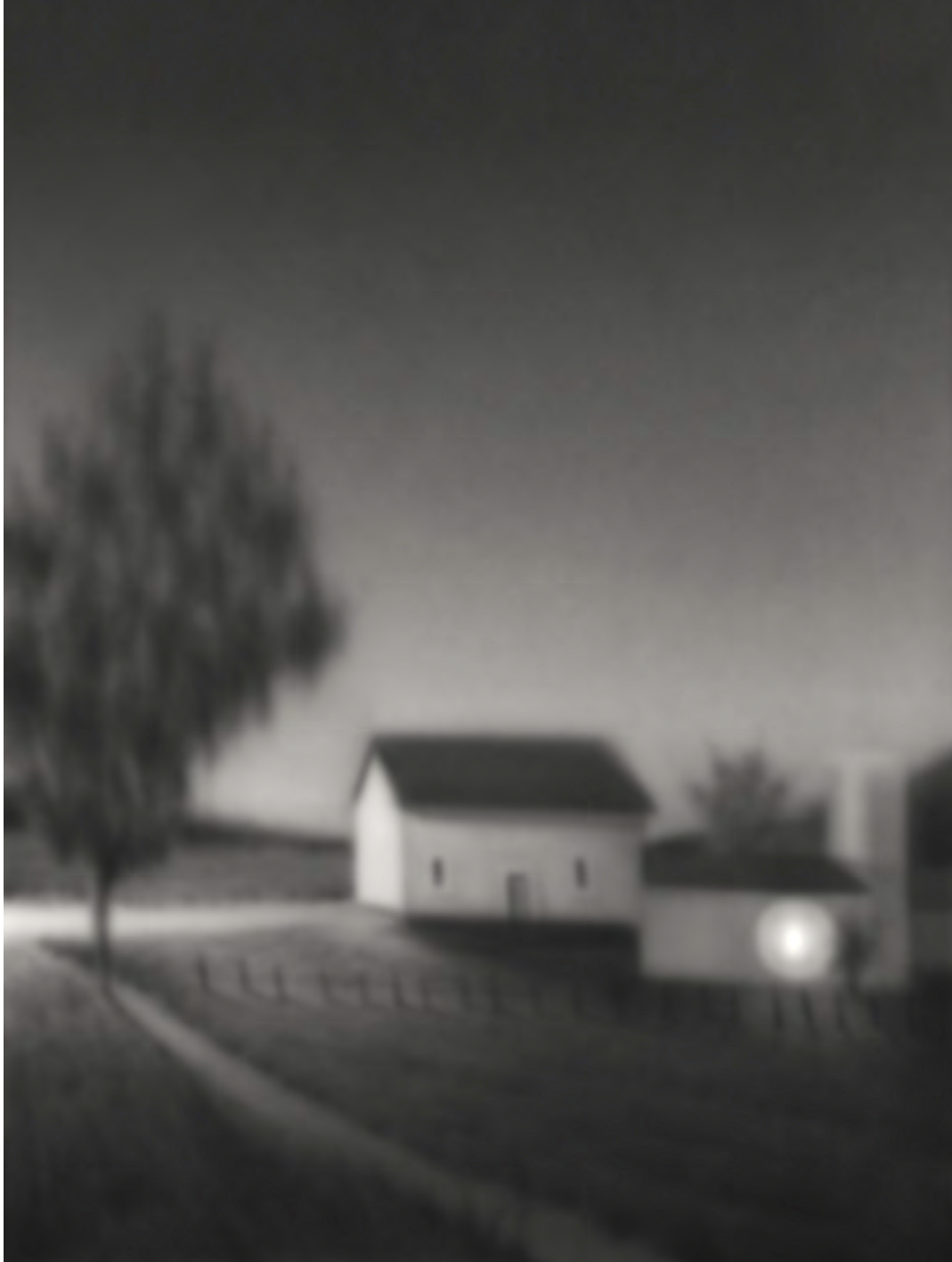
Alzqueta Gallery Hugo Alonso Other's painting 2021 Acrylic on paper 113 x 133 cm